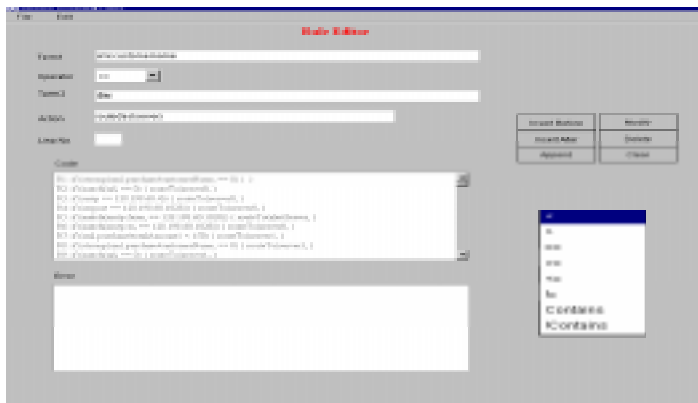
Figure 2. Java-based Interactive Content Switch Rule Editor

We have implemented an interactive Java-based Content Switch Rule Editor, RuleEdit, for editing the content switch rule set and detecting the conflicts between the rule being specified and the existing rule set. Figure 2 shows the screendump of RuleEdit. It can open the text file of an existing rule set, and load the rule set into its internal structure. It currently only implements rule conditions with one basic term. The user can enter the variable, the relational operator, and the value of a relational expression, or a Boolean expression. On the right hand side is a set of buttons for inserting or appending the rule to the rule set based on the line number, and for deleting certain rule. The text window below shows the rules in the existing rule set.